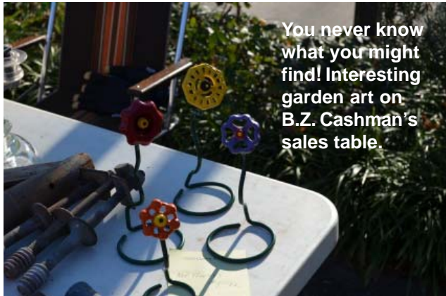
You never know what you might find! Interesting garden art on B.Z. Cashman's sales table.