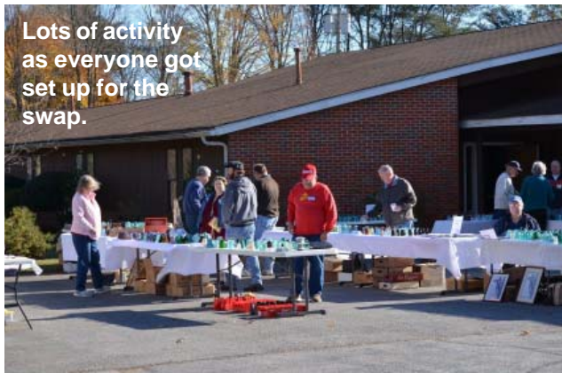
Lots of activity as everyone got set up for the swap.