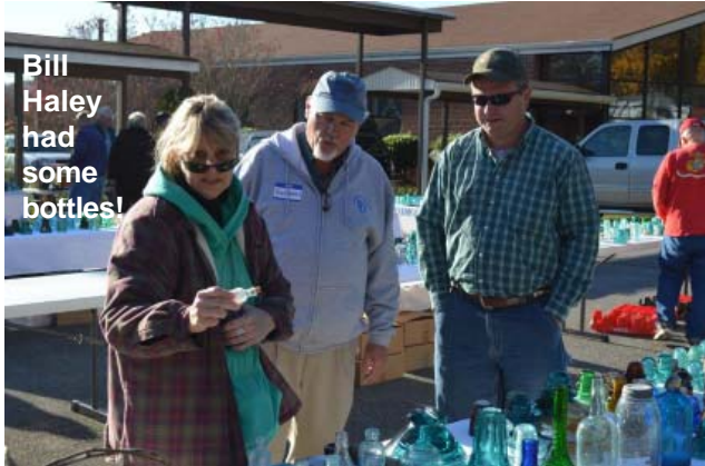
Bill Haley had some bottles!