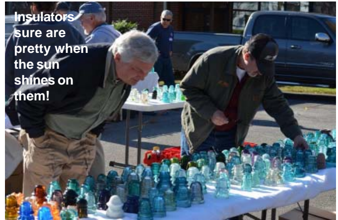
Insulators sure are pretty when the sun shines on them!